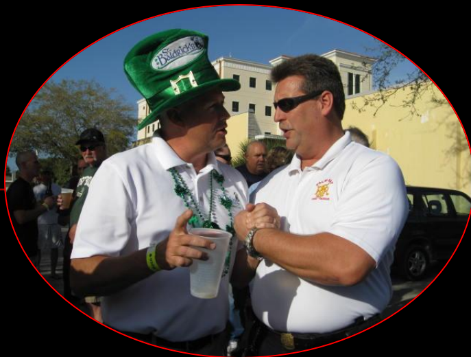
Friends of PBF-R